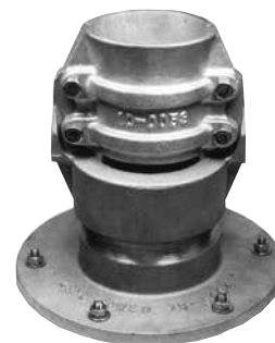
Flange Terminator Kit

*Available in the Lightning Fast Delivery Program