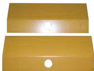
Skid Plate Kit