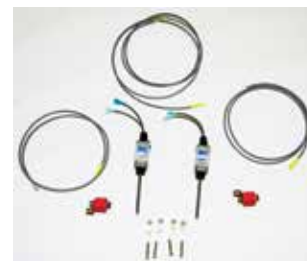
Lid Switch Kit