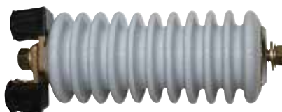
High Voltage Termination Kit