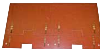
15kV Barrier Kit