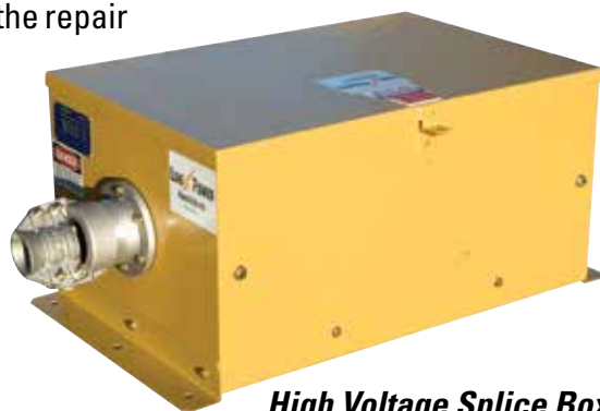
High Voltage Splice Box