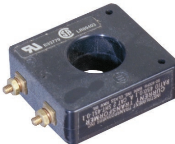
P/N: 08-0362 Current Transformer