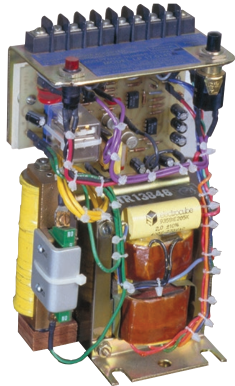
Part Number: 17-0143