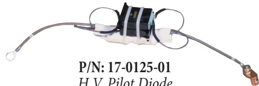
P/N: 17-0125-01 H.V. Pilot Diode