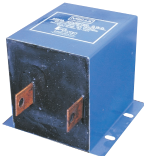
P/N: 92-1004 Inductor Ground Wire Device