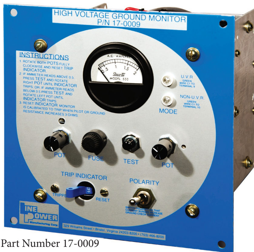
Part Number 17-0009