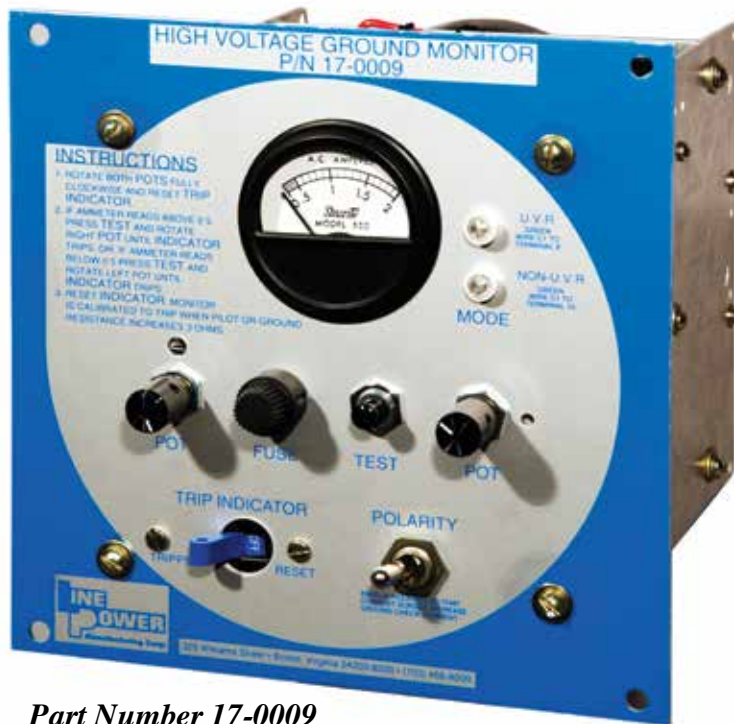
Part Number 17-0009